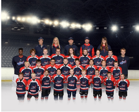
WEST MICHIGAN PATRIOTS